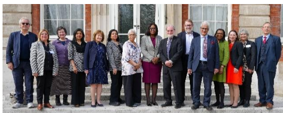
IFCO Steering Committee with the High Commissioner for Antigua & Barbuda, with retiring members, at Marlborough House, April 2026

Commonwealth Accredited Organisations (AOs) celebrated the relaunch of the Independent Forum of Commonwealth Organisations at a conference on Marlborough House on 27 th April 2026. The conference was the first held under the new constitution and heard from the three Commonwealth intergovernmental institutions as well as the UK Foreign, Commonwealth and Development Office.